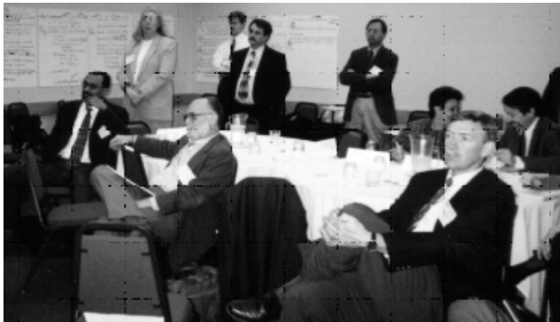
March 1998 Chicago NORA Focus Group Meeting

In addition, new ideas contributed by the academicians and researchers at the Houston workgroup meeting were added to the listings. The resulting four lists of research issues are provided in Appendix A. These lists are designed to provide comprehensive inventories of the issues only and do not provide any indications about what the NORA MSD team believes about the priority or importance of individual research issues. Some of the issues identified in the focus groups applied to more than one industry, while others were primarily applicable to specific industries. The selected industry-specific topics are listed in Appendix B. The Houston workgroup was asked to identify research topics where progress seemed most likely in the next five years. Those ideas are listed in Appendix C.